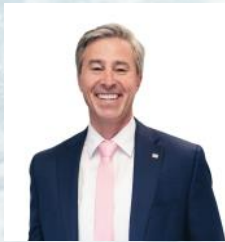
Sean Fraser Member of Parliament

On behalf of the Government of Nova Scotia, it is my pleasure to welcome you to the commemorative events that celebrate the 250 th anniversary of the arrival of Ship Hector in Pictou, Nova Scotia.